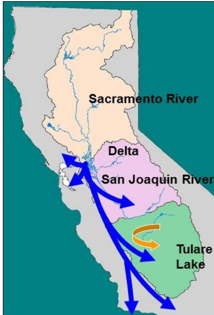
Figure 1-2. Central Valley Surface Water Flows

The widely varying characteristics of these hydrologic regions pose challenges to the management of salt and nitrate in the Central Valley. The best approach or solution to minimize water quality impacts in one region may not be the best approach in another region. The CV-SALTS planning process has strived to develop an SNMP that considers this variability. In addition, this planning effort has focused on complying with State Water Board Resolution 2009-0011 (Recycled Water Policy, as amended by State Water Board Resolution 2013-0003).